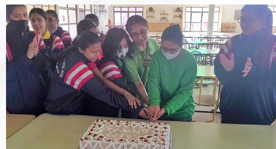
30th April, 2022: Birthday Celebration