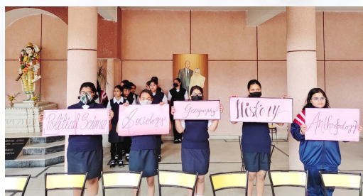
27th April, 2022: Departmental Assembly conducted by the Department of Social Science