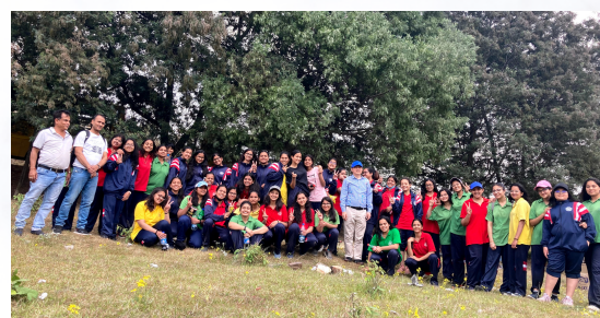
14th April 2022: Picnic and Outing