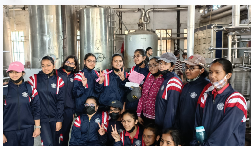
29th April, 2022: Visit to Almora Milk Production Co-operative Association Ltd.