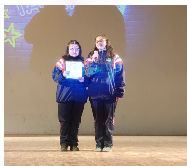
15th April, 2022: Students went to GD Birla Memorial School, Ranikhet and participated in the Talent Search Show.