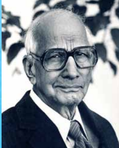
Late G. D. Birla