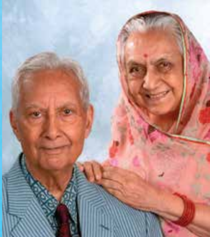
Late B. K. Birla and Late Sarala Birla